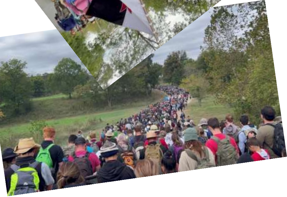
Three Hearts Pilgrimage to Clear Creek Monastery Hulbert, OK October 12-14, 2023 A two day, 35 mile penitential walk offering our physical and spiritual sacrifices for the defense of the traditional family and the sanctity of life, while pursuing that which is good, true and beautiful.