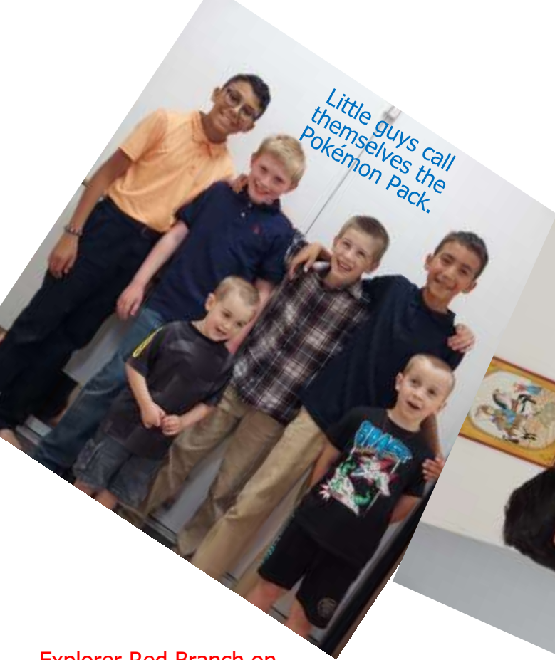
Little guys call themselves the Pokémon Pack.