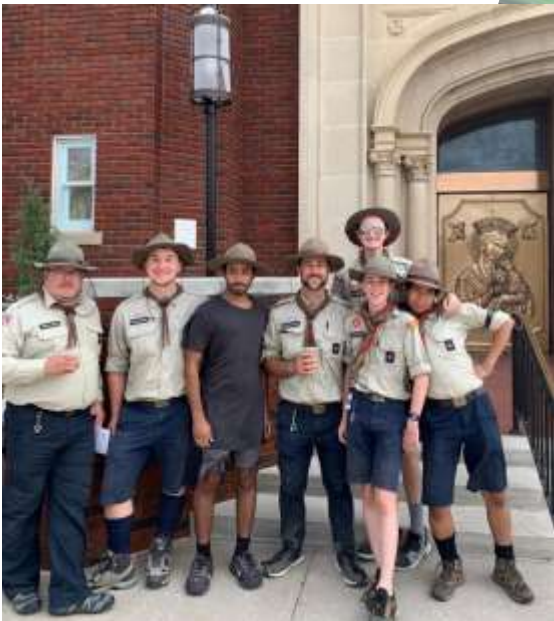
Explorer Red Branch on Three Hearts Pilgrimage