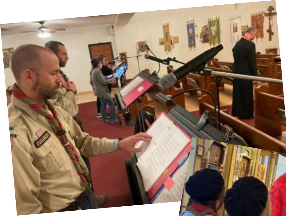
Canon of St. Andrew