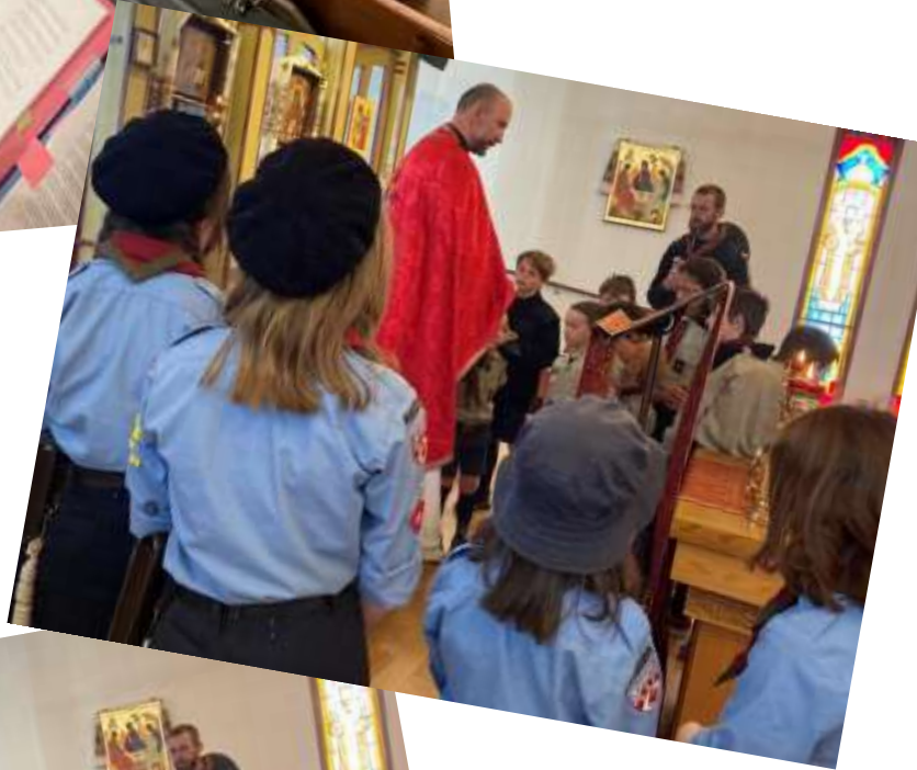
All Souls with Explorers