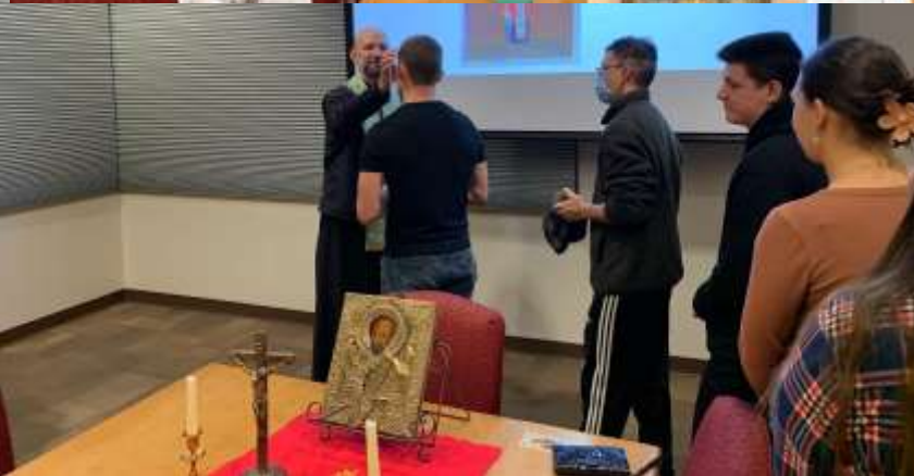
CAFE group at UNM celebrates St Nicholas