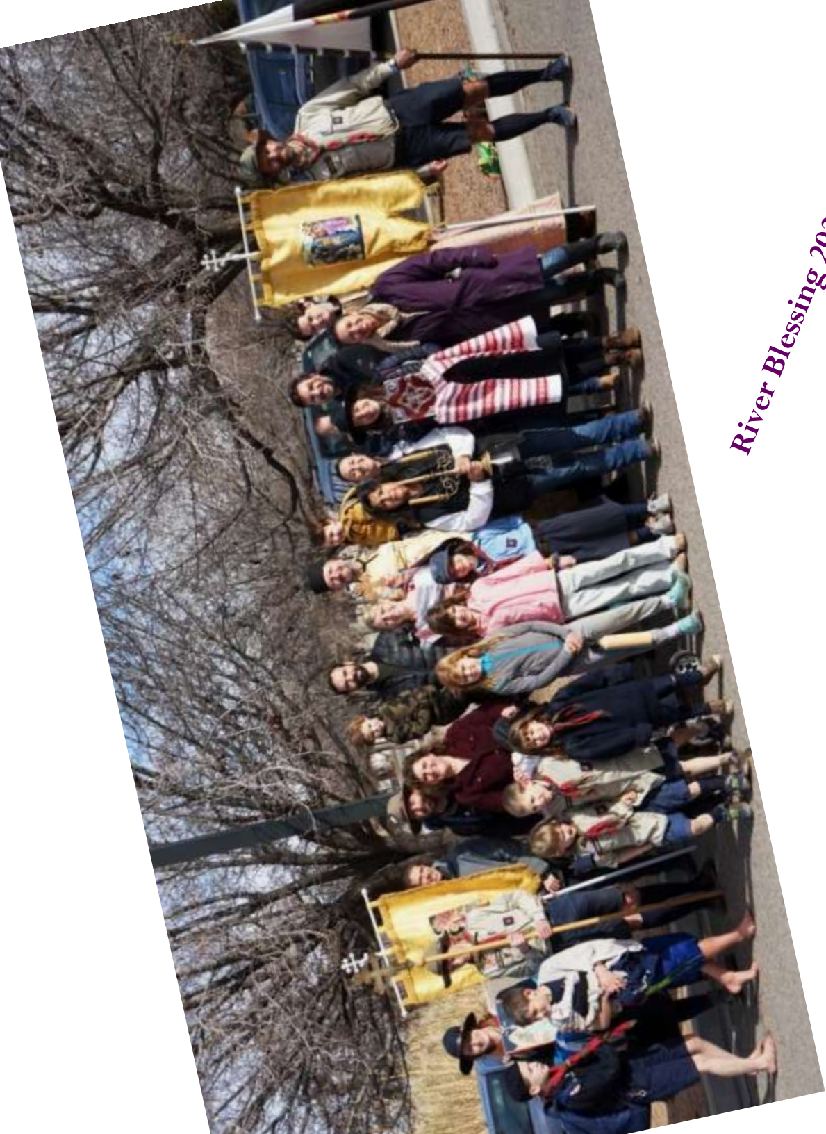
River Blessing 2023