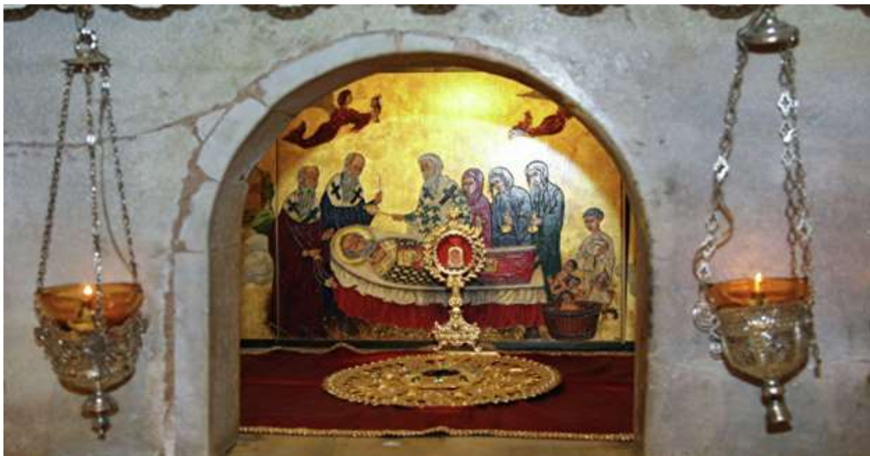
Tomb of Saint Nicholas in Bari, Italy

May 9 is the feast of the two patron saints of travelers: Translation of the Relics of St Nicholas of Myra and St Christopher. After Myra was taken by the Turks, there was a very real danger that the church of Saint Nicholas would be turned into a mosque and his relics vandalized. Myra and Bari had a long history of mutual trade and devotion to Saint Nicholas, patron of sailors. In 1087 merchants from Bari removed the sacred relics and carried the body of the saint to Italy. There he reposes in a magnificent shrine built by the Greek and Latin Christians of the city, and there the relics still give off "myrrh", a clear liquid that is used to anoint the sick. Cures still take place at the tomb. In Myra, meanwhile, the Christians were indeed expelled and services forbidden in the original shrine, which is now a ruin.