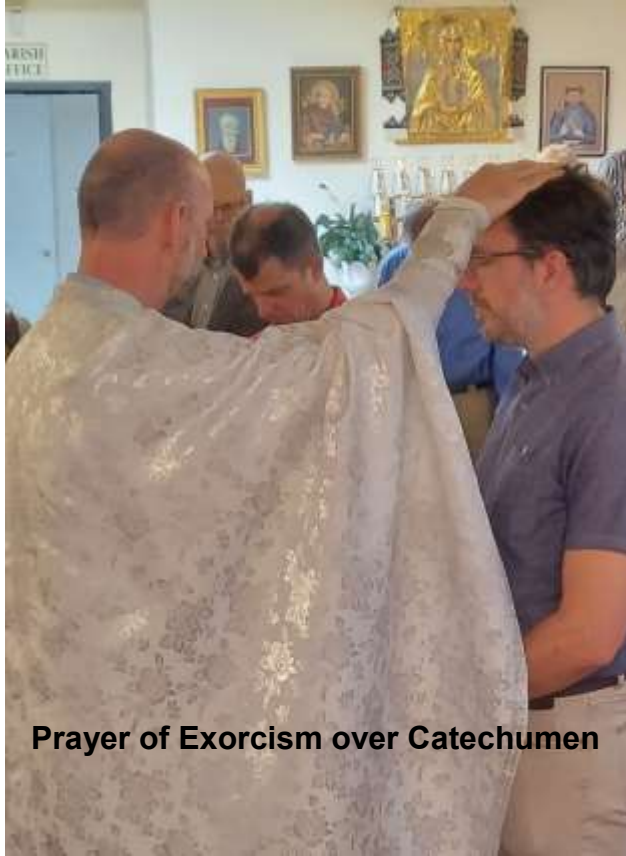
Prayer of Exorcism over Catechumen