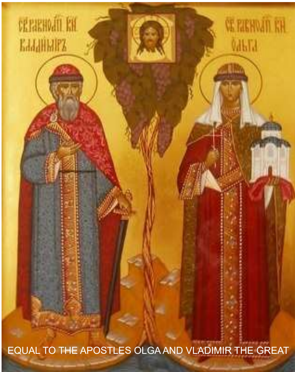
EQUAL TO THE APOSTLES OLGA AND VLADIMIR THE GREAT

July 10, 2022 / T one 4/ 5th Sunday A fter Pentecost Christ is Among Us! He is and Always Shall Be!