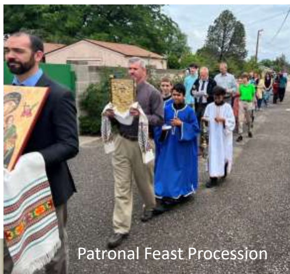
Patronal Feast Procession