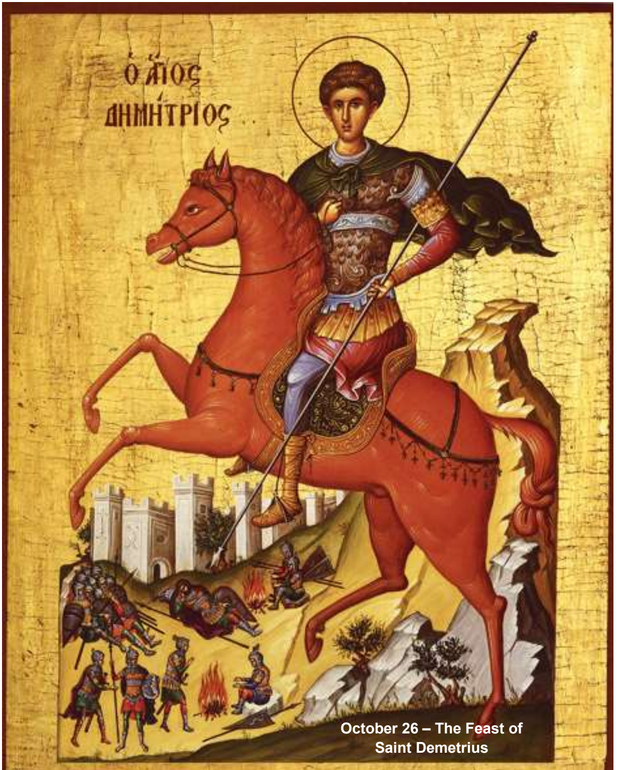
October 26 – The Feast of Saint Demetrius

October 23, 2022 / T one 3/ 20th Sunday After Pentecost Christ is Among Us! He is and Always Shall Be!