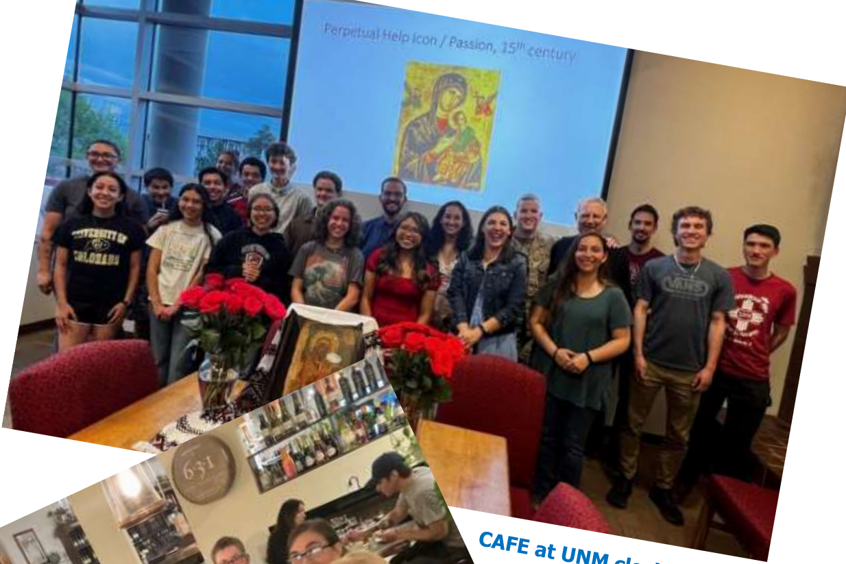
CAFE at UNM closing meeting Ladies night out Pentecost Monday