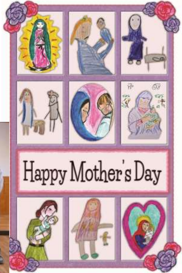
Happy Mother's Day