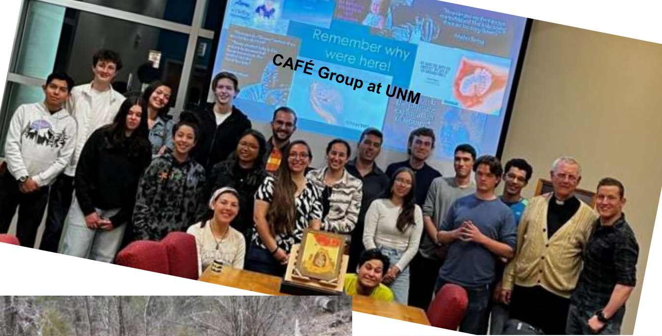
CAFÉ Group at UNM