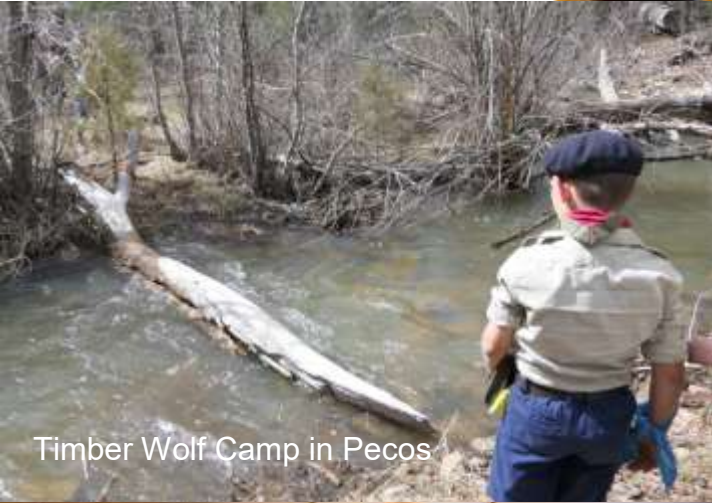
Timber Wolf Camp in Pecos