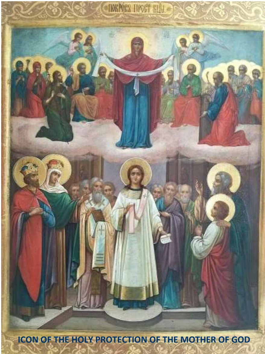
ICON OF THE HOLY PROTECTION OF THE MOTHER OF GOD

September 25, 2022 / T one 7 / 16th Sunday After Pentecost Christ is Among Us! He is and Always Shall Be!