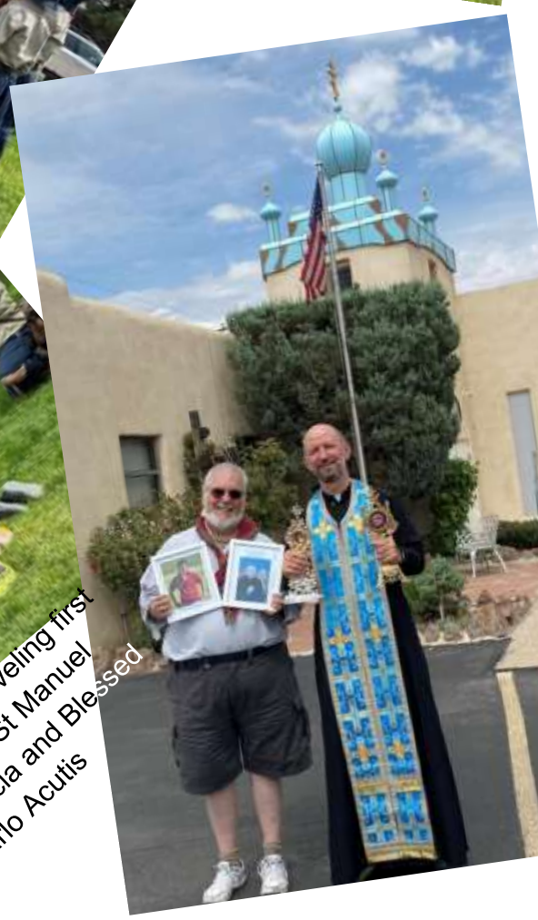
Blessing with the traveling first class relics of St Manuel Gonzalez Garcia and Blessed Carlo Acutis