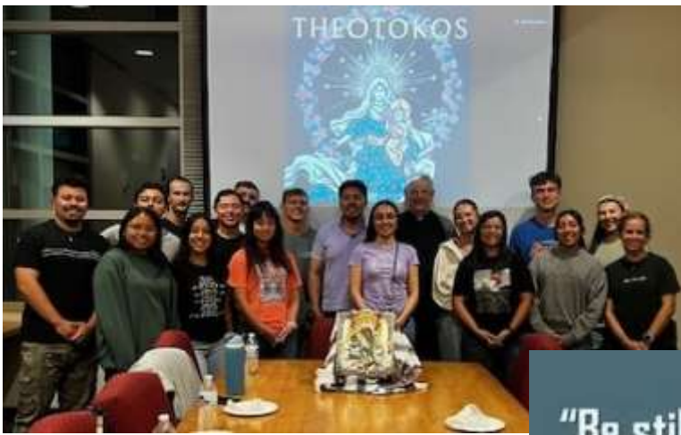
CAFE Meeting at UNM October 1, 2024