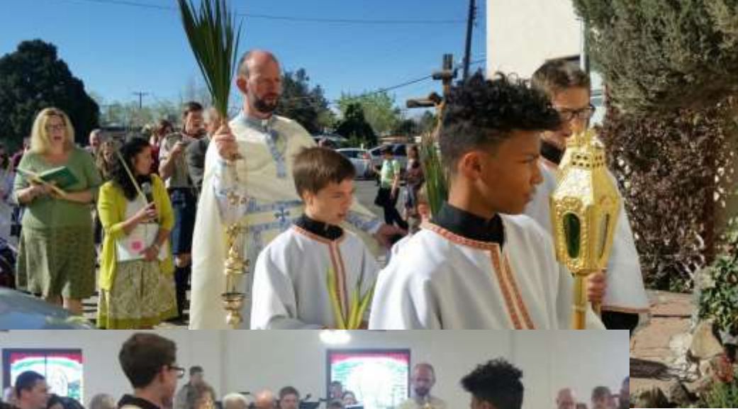
Palm Sunday Procession