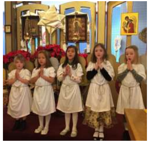
Bethlehem Carolers Play