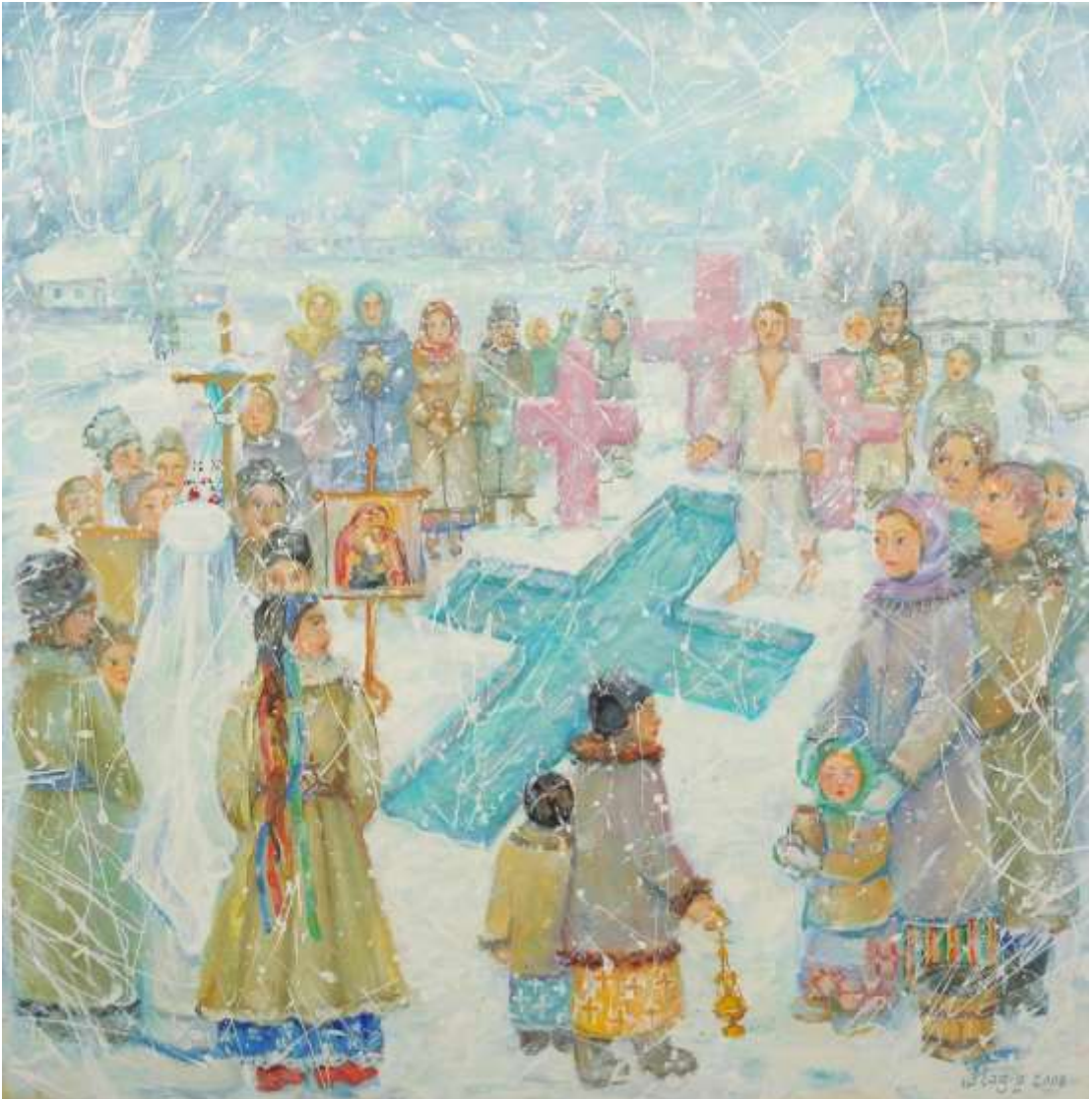
Theophany Water Blessing at the Riverside

Glory to Jesus Christ! Glory to God Forever!