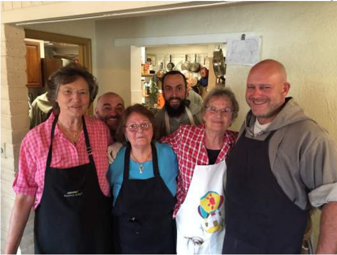
Part of the OLPH crew at the Franciscan Friars of the Renewal serving Wednesday lunch for the poor

The Friars of the Renewal can always use men's and women's clothing, and personal hygiene items like non-alcohol mouthwash, soap, shampoo, etc. Buy small travel size items as those can be given to the poor easily.