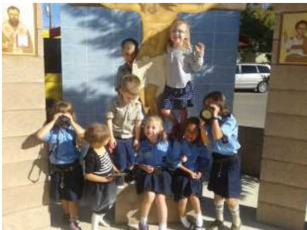
Explorers Fundraiser Lunch