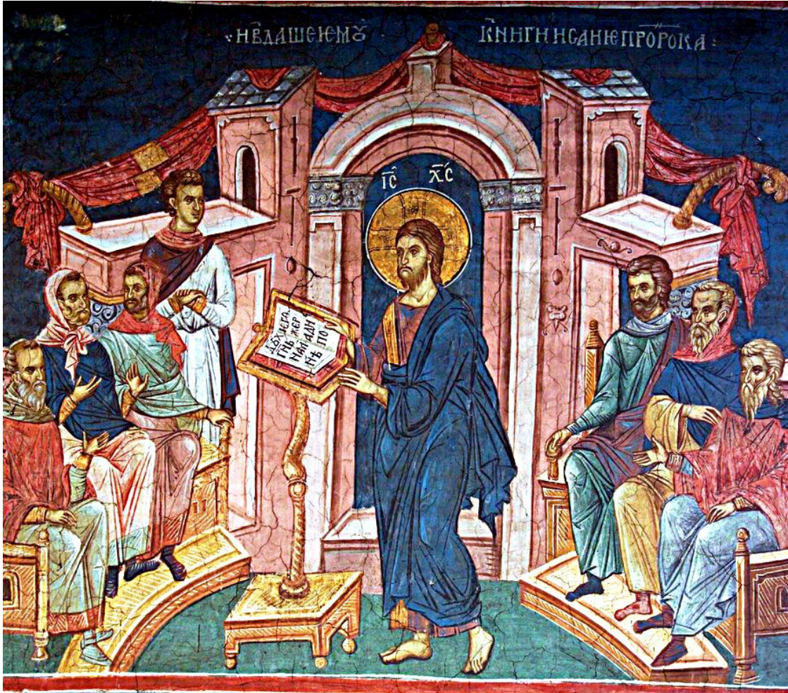
Jesus Reads in Synagogue

Happy Beginning of the New Church Year September 1