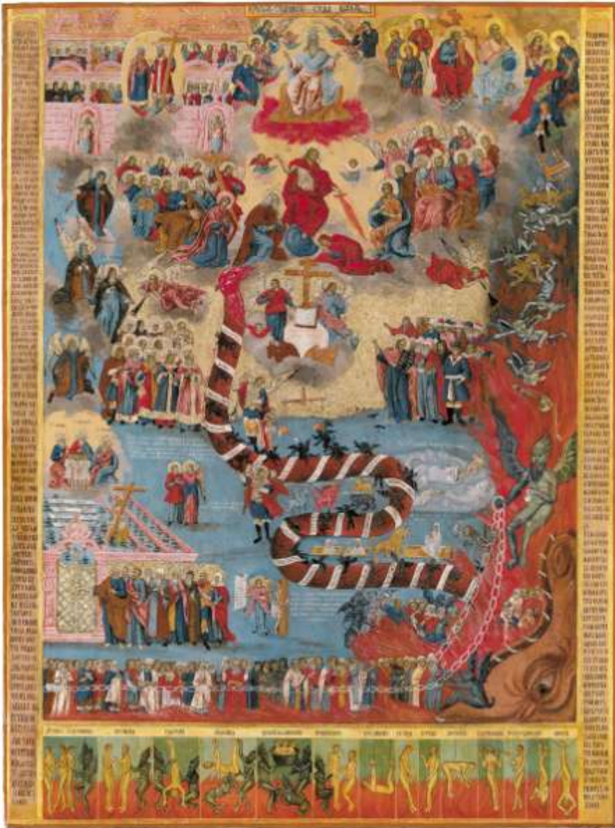
The Last Judgment