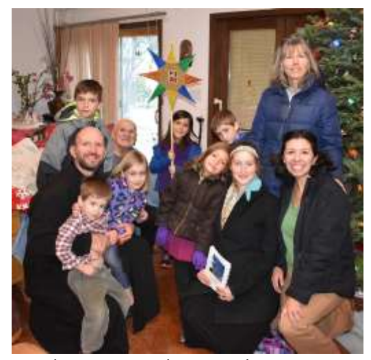
Christmas Carolers visit shut-ins