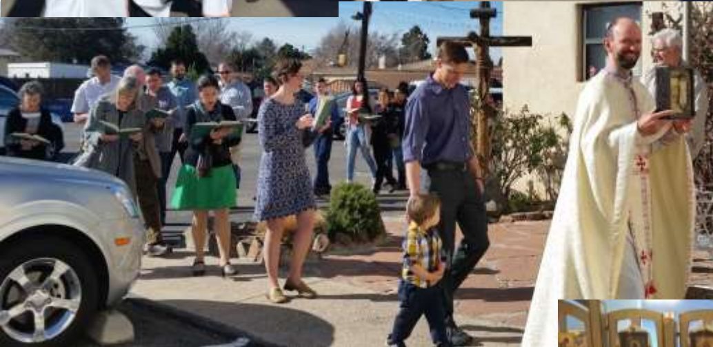
1st Sunday of the Great Fast— Triumph of Orthodoxy— Procession with Icons