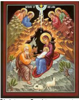
Christmas Card to support our Mother Church in Mukachevo, Ukraine