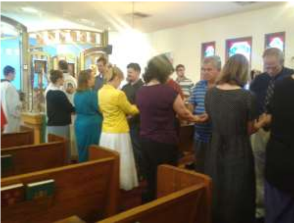
Blessing of Married Couples