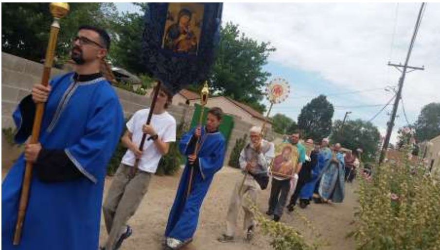
OLPH Patron Feast procession