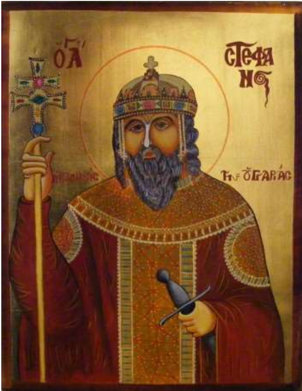
Saint Stephen of Hungary

August 17, 2025 / Tone 1 10th Sunday After Pentecost Christ is Among Us! He is and Always Shall Be!