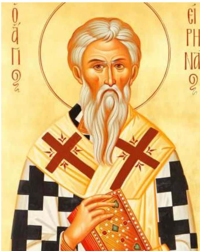
August 23 Irenaeus of Lyons

Irenaeus is very important in Christian history! Born around 120 AD into a Christian family in the city of Smyrna, he was familiar with St. Polycarp, the disciple of St. John the Theologian. He emigrated to Lyons in southern France and served as a priest who actively fought against heresies. He became the city's second bishop, serving as a missionary, pastor, and one of the first great Catholic theologians. His main work is Against Heresies , defending the Faith against the different Gnostic teachings that claimed salvation required knowing “secret” wisdom. Irenaeus defined the “ pillars of orthodox faith ” as the Sacred Scriptures, Apostolic Tradition, and the teachings given by bishops who are the successors of the apostles. Irenaeus is one of the first writers to define the Scriptures, including the Four Gospels, the Old Testament, and authentic apostolic writings.