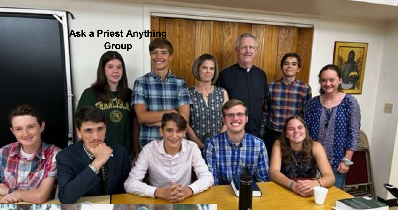
Ask a Priest Anything Group