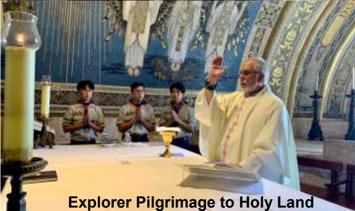
Explorer Pilgrimage to Holy Land